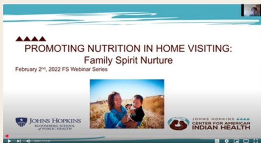
Promoting Nutrition in Home Visiting