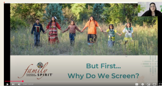
Screenings in Home Visiting