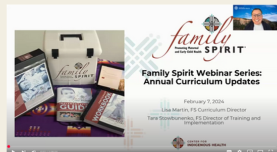
Annual Curriculum Updates